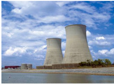
Sequoyah Nuclear Plant in Tennessee.